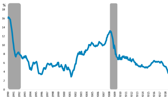
Canadian Mortgage Credit (% Year-over-Year)

Note: Grey Bars are Canadian Recessions