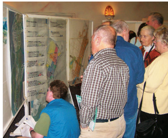
Members of a Squamish charrette team, April 2005

From the perspectives of policy formation and marketability, this collaborative approach will continue to help make sustainability a tangible concept for the real estate profession. Involvement in the process strengthens the profession's public presence and helps REALTORS® provide their clients with livable, sustainable community options.