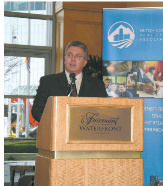
Hon. Murray Coell, Then-Minister of Community, Aboriginal and Women's Services , at BCREA's January 2005 Real Estate Services Act Celebration

This licensing approach could assist with income tax planning options that reflect the cyclical nature of the marketplace. The provincial government is examining the mechanics of how the proposal can work best. Although no