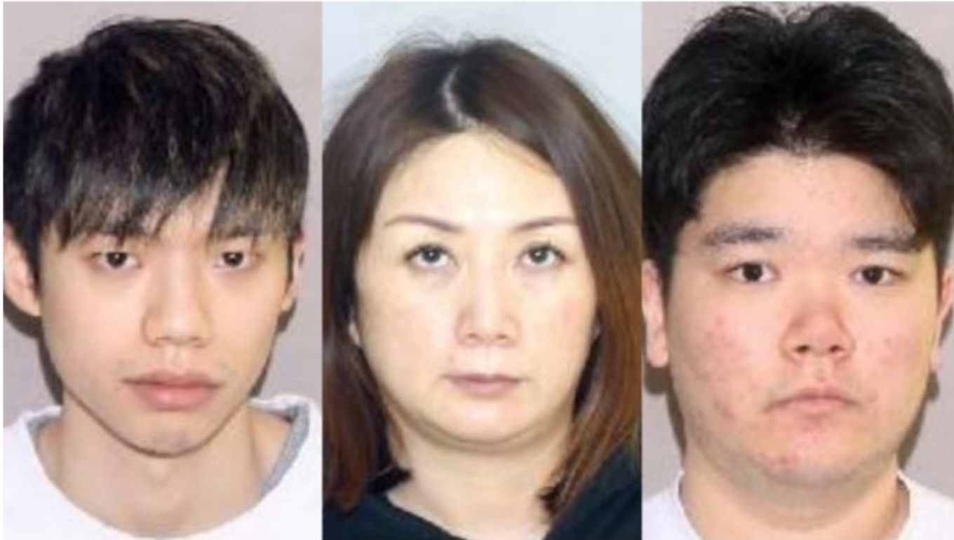
Images of the three suspects wanted in connection to a title fraud scam in Toronto.

3 people charged after allegedly impersonating homeowners to sell Toronto property